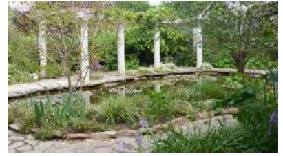
Al Ru Farm, One Tree Hill

Please Note: For 2023 each garden will only open if deemed safe to do so by Government Authorities and will follow COVID-19 guidelines as may be in place at the time.