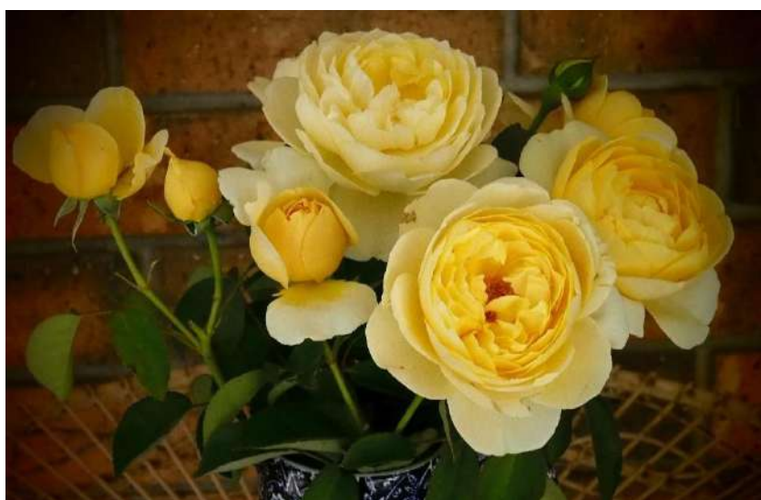
David Austin Rose – Charlotte

After such a wet, cold and windy Spring, Summer has been eagerly anticipated by many of us! The change in conditions may be challenging for our gardens (and us) which have not experienced the usual steady rise in temperatures and opportunity to “harden up” ahead of the heat. It will be interesting to see how our gardens cope. Open Gardens SA takes a short break from opening gardens in December – and returns with more gardens in the New Year. And finally, the Open Gardens SA Committee wish you all a very safe and Happy Christmas.