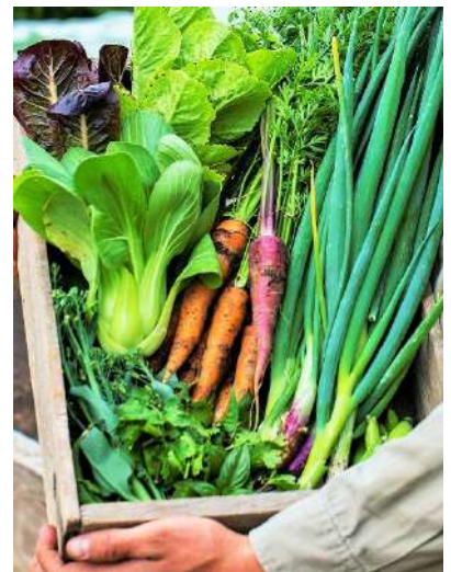
Harvest Garden Festival, Various locations in Adelaide and greater metropolitan area