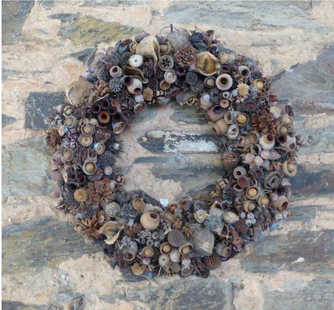
Best Wishes for a peaceful and happy Christmas 2022

Open Gardens South Australia is a not for profit organisation opening private gardens to the general public.