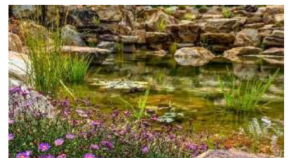
Cascade Water Garden, Crafrers