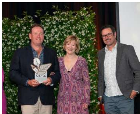
JUDGES' CHOICE AWARD HILLS CLASSIC GARDENS WELLSWOOD COTTAGE WINNER 2022 AWARDS OF Excellence