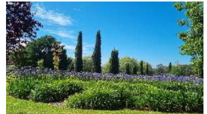
Littlewood Farm, Littlehampton