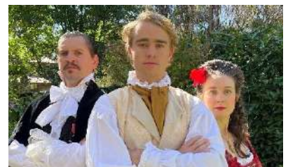
Theatre in the Garden, The Scarlet Pimpernel, Victor Harbor, Hahndorf & Blackwood