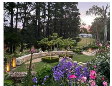
RESIDENTIAL LANDSCAPE DESIGN EXCEEDING $250,000 HILLS CLASSIC GARDENS WELLSWOOD COTTAGE SPONSORED BY HERBES WHOLESALE NURSERY WINNER 2022 AWARDS OF Excellence

Congratulations gentlemen! And many thanks for your contributions to Open Gardens SA.